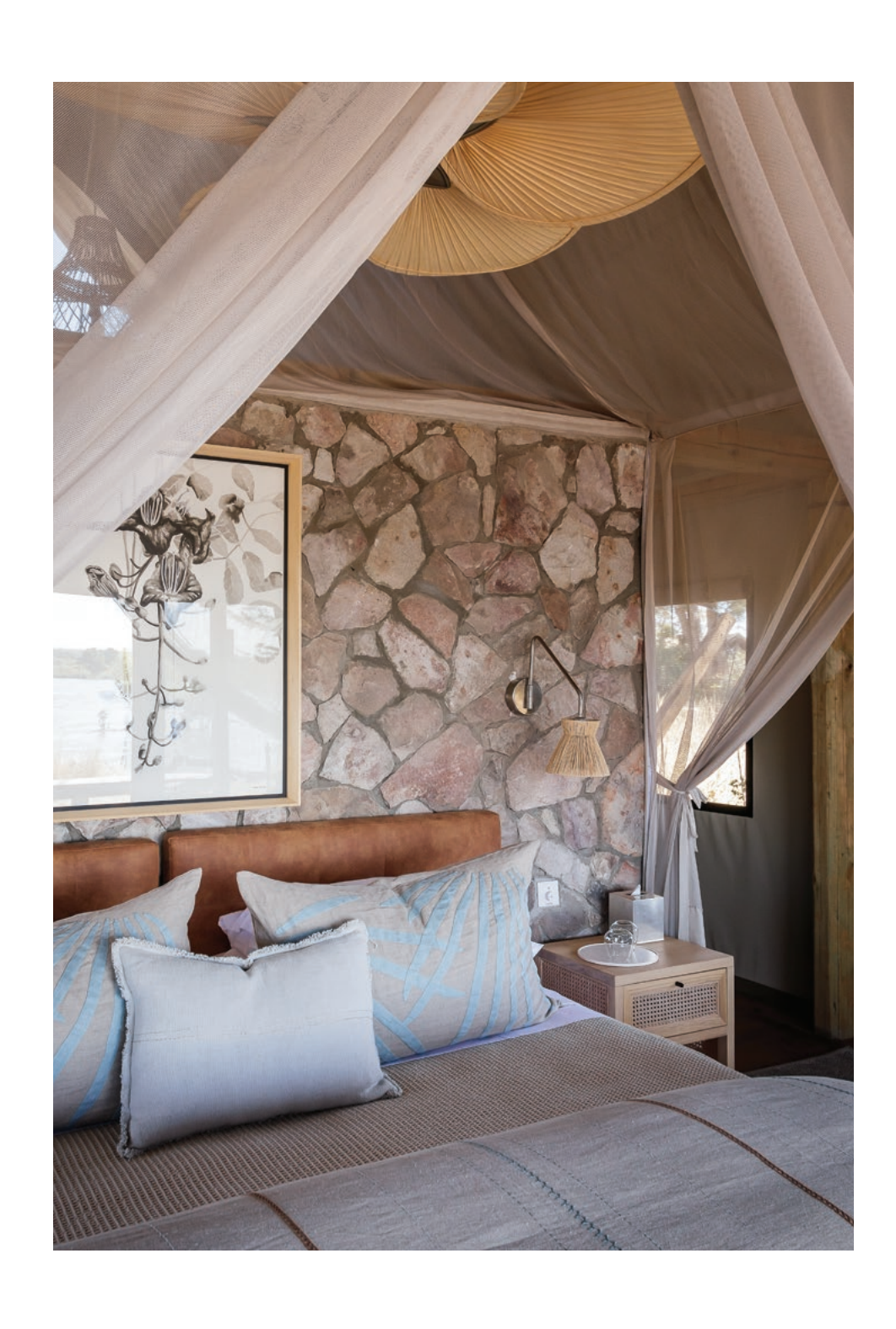
This spread and next spread Each guest suite has a private living area and outdoor bath and shower that faces directly onto the river. The contented grunts and groans of hippos become the exquisite soundtrack to a stay at Mpala Jena.